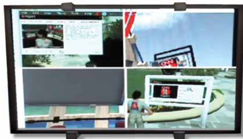
CNN produced a training video that shows how to submit a story.

CNN's Second Life facility includes a news desk where CNN producers plan to hold weekly editorial discussions with iReporters, and an amphitheater for larger events, such as the one on the opening day. Each citizen journalist iReporter is given a kit with a HUD, a press badge, tee shirt, and a nice cap.