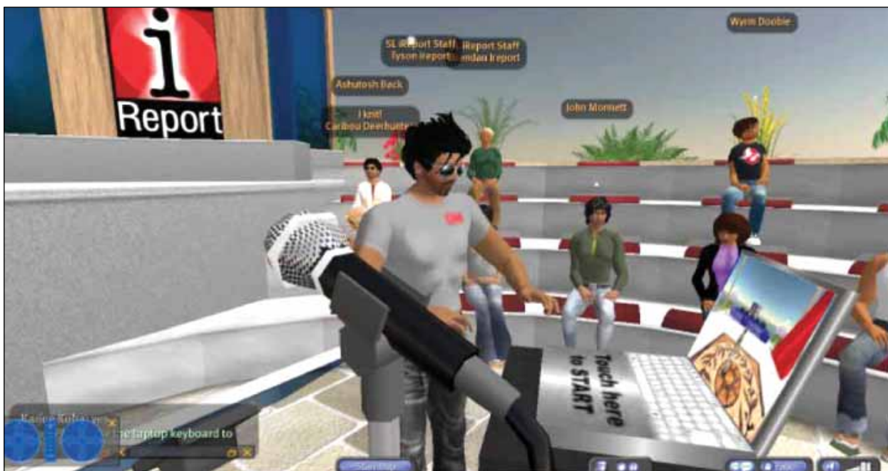
Tyson iReport led CNN's first in-world training session

I had to leave before the presentation was over, but later that night I stopped by to see what was happening. It was quite late, but I found a few people gathered in the CNN amphitheater. There was an avatar named Keno28 Zerbino standing in the center shouting: