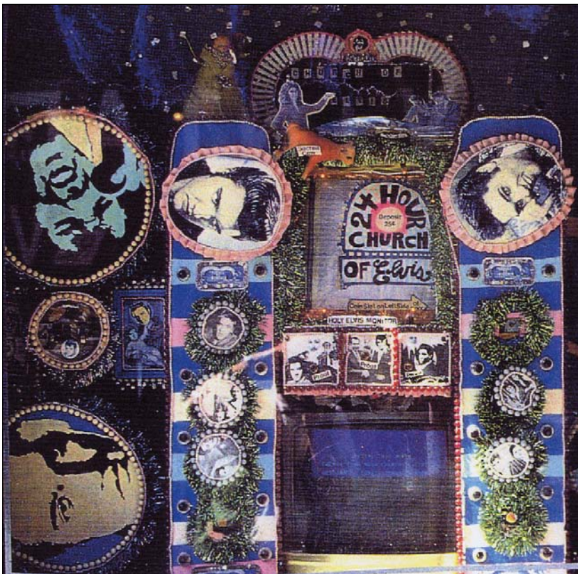
The former 24 Hour Church of Elvis in Portland, Oregon.

I check my Sacred Elvis Detector, and I notice that it now says... OUT. At least until next week. Yes, Elvis is Everywhere. ☿